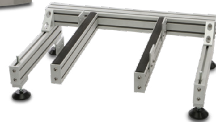
Cart stand for use with Acumen or Landmark tabletop units