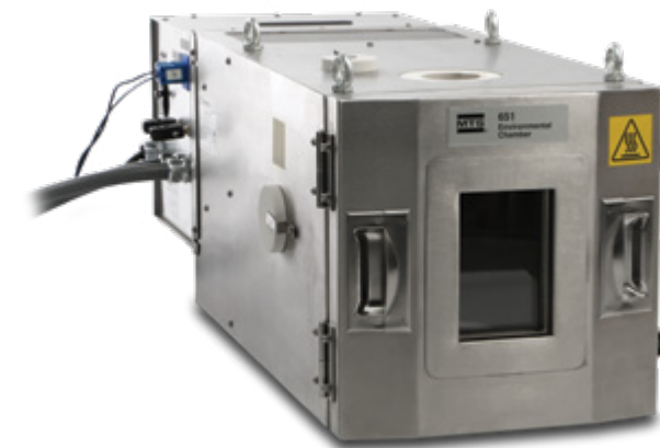
651.05F-01 chamber for use on Acumen

Series 651 chambers are ideal for research, reliability testing, quality control and production testing. Typical applications include body and engine mount tests, tire cord tests, vibration isolator tests and material studies of elastomers, plastics, polymer matrix composites and laminates.