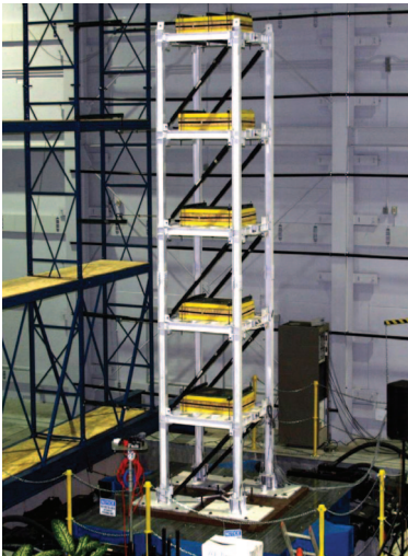
Testing of added clamping system in 5-story structure

MTS helps a pioneering university lab pursue advanced civil structural testing and simulation.