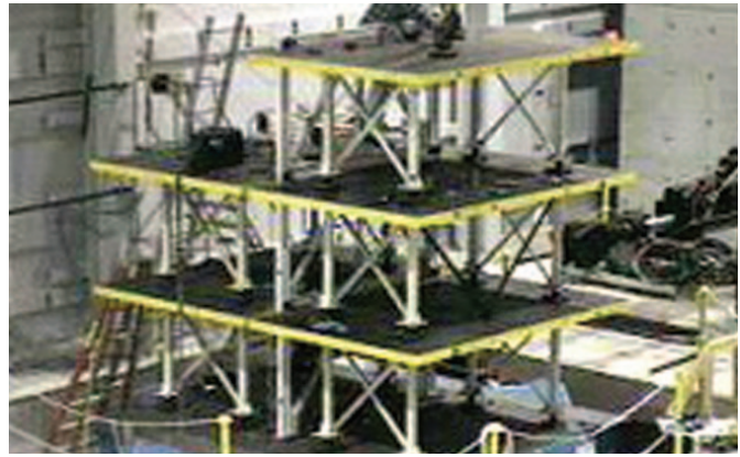
Shake table test of steel structure with advanced braces (zipper frames)

facility for nonstructural component simulation, composed of a two-story shake table with strokes of +/- one meter and velocities of up to three meters per second.